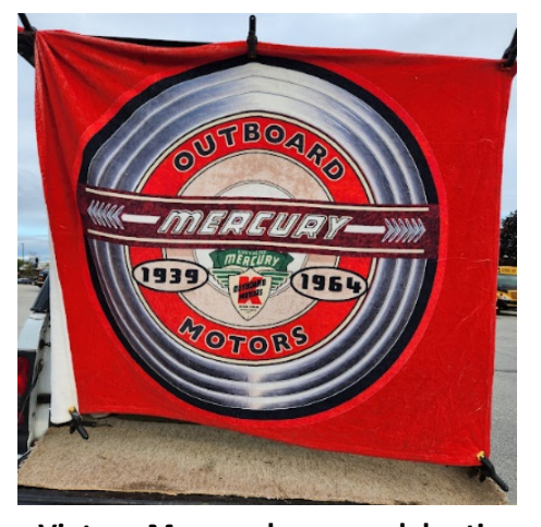
Vintage Mercury banner celebrating the brands 25th Anniversary in 1964.