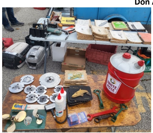
Great variety in the "Swap Meet".