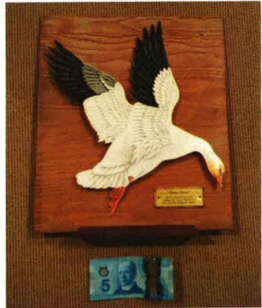
Larger real wood plaques were made for display in Johnson & Evinrude Dealerships. The 3-D birds & fish were made of heavy cardboard.

Don't go there. These were produced by the thousands over many years and are readily available in many Antique Shops in Canada for $12 to $20, depending on condition. Older is better. Elto and Gale Buccaneer with the dogs, are the most rare. Having the "hang down" calendar pad is a bonus. Solid black is the newest and least desirable.