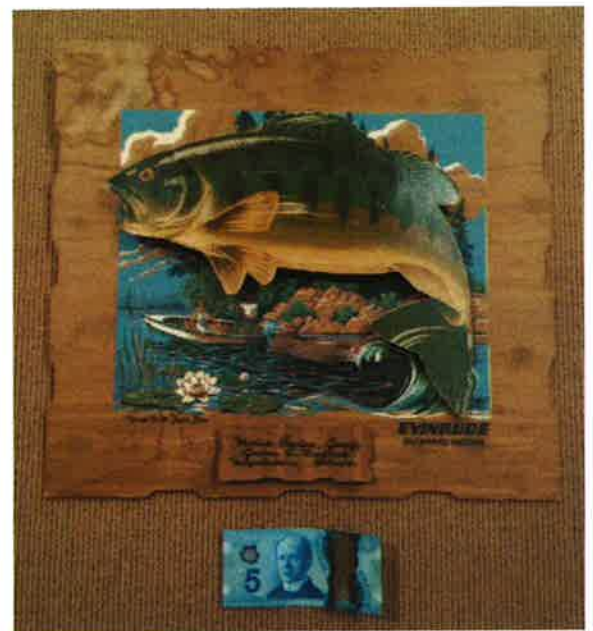
The largest 3-D format produced for Johnson & Evinrude Dealers measured 29" x 25". (Evinrude version on the left) These are extremely rare. A mid-size version 20" X 18" (shown on the right) was also produced & is easier to find.