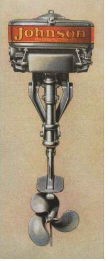
Fig. #2. 1928 Johnson K-40

The Johnson K Series - The Predecessor of the OK The K series was introduced by Johnson in 1927 as the K-35 Standard Twin (Fig. #1). This motor filled the gap between the A series Light Twin and the P series Big Twin. The motor featured a 2-5/16" bore and 2-1/16" stroke, resulting in a displacement of approximately 17.3 cubic inches. The motor was an opposed twin with simple barrel type carburetor. During these early years, the horsepower was given as a range based on RPM. The 1927 catalog