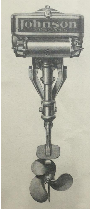
Fig. #1. 1927 Johnson K-35 the first of the K Series