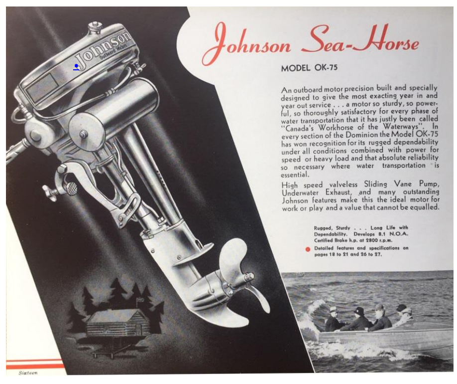
Fig. # 7. 1935 Johnson OK-75. The first new OK model since 1932. Note there is no "Sea Horse" name on the decal.

The Johnson model list for 1935 includes the model OK-75 with a rating of 8.1 HP (Fig. # 7) however, the OK-75 does not appear in the US version of the 1935 catalog. The horsepower rating of the OK-75 was returned to the 8 HP mark because the rating of the alternate firing K series had been boosted to 9.3 HP by 1935. The OK-75 is the last OK model that appears on US built model charts and marks the end of the OK series production at the Waukegan, IL plant. It is unclear why the OK-75 was not included in sales literature in the US. The OKs were omitted from the full line catalogs and price lists after 1932. From here on, the story of the OK series moves North.