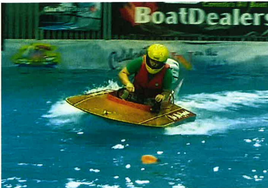
Exciting action- propane powered Outboard Sea Fleas racing indoors.