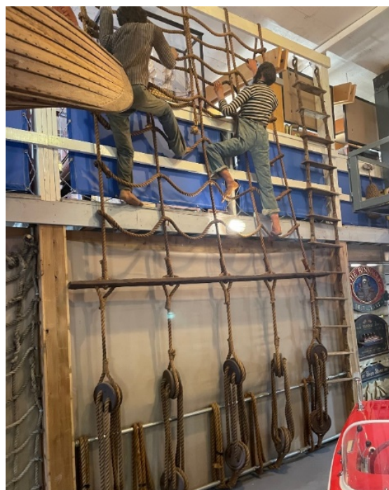
Two scoundrels trying to escape Wayne's World without paying for lunch!