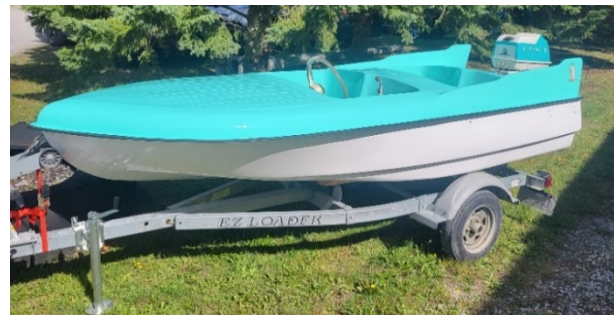
Kyle Hubners 50's era Mini Boat with 15 HP Viking outboard.