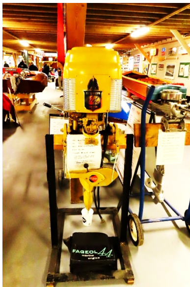
Ken Kirk's 4 cycle, 4 cyl, Fageol 44.