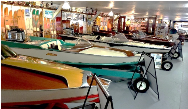
Wayne Robinson's Collection of Award Winning AristoCraft Boats.

Outside... the event continued to impress. There were fifteen vendors in the Flea Market/Swap Meet. A large volume of quality outboard motors and parts were offered for sale. Boat hardware and accessories, controls, gas cans and gas tanks plus a good selection of oil cans...all available. Also, a good selection of hard-to-find boat and outboard sales and service literature.