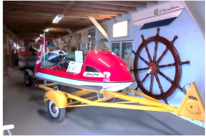
Wayne's Aqua Loop, early days, personal watercraft with Evinrude power.