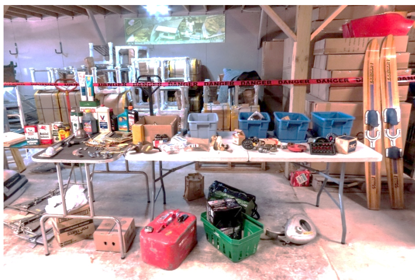
Wide assortment of boat & outboard parts & accessories available for sale.