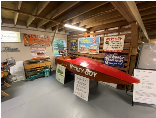
1920 Peterborough "Bullet" with Lockwood Racing Chief. Raced in the first ever boat races at the CNE.