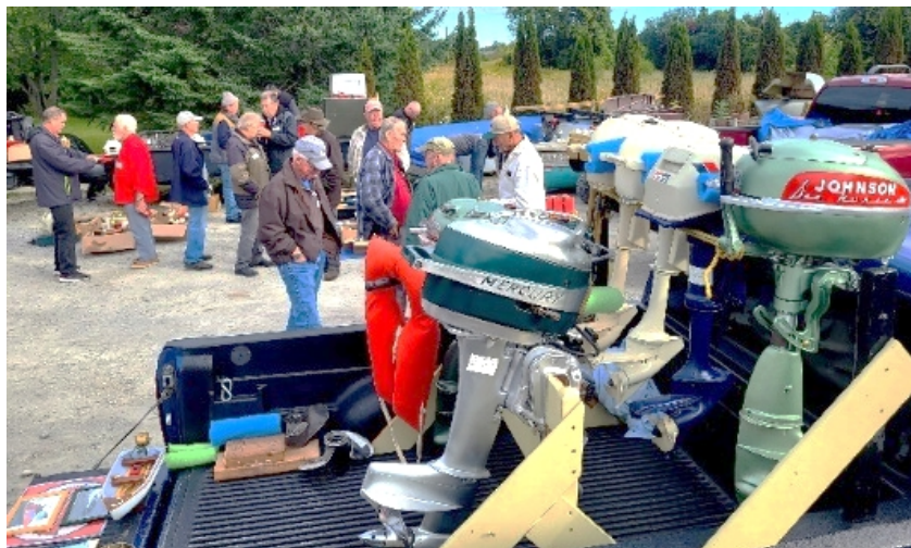
Active Flea Market/Swap Meet with good selection of motors For Sale.