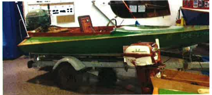
From the Kids & Classics Boat Shop Museum, a restored TNT with 53' Johnson 25' (top) & "Mini-Hopper" Sea Flea (below).