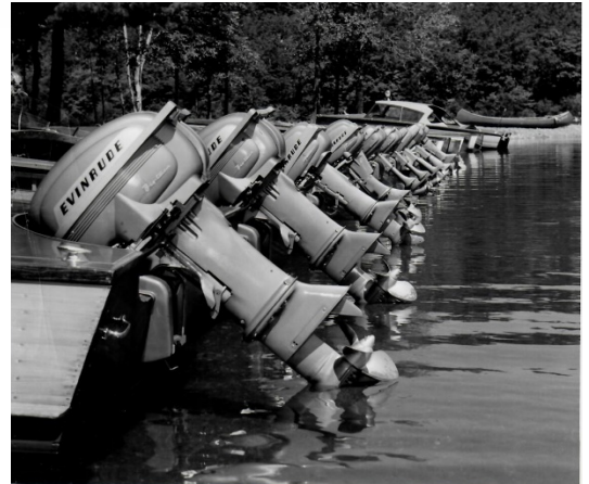
Evinrude “Big Twin” 25’s ready for action at a Northern Ontario fishing lodge.

Take pictures of the motor before any disassembly, especially the hood if you plan to paint and apply new decals. The pictures will give you references to where the decals go.