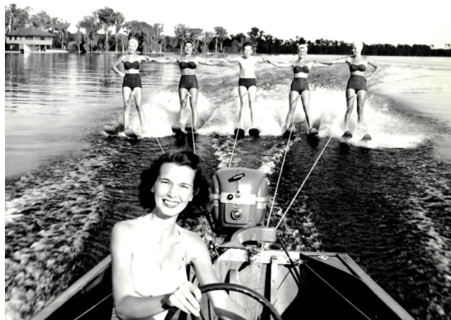
Evinrude "Big Twin" 25 hp pulling five water skiers. That's Pulling Power.

Start at the top and remove the recoil start. Then the side brackets, identifying the right and left bolts on the clear plastic bags. Remove other peripheral items like the shifter Lock Bar, throttle linkages, vacuum switch and any other pieces that can be removed