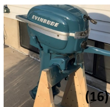
Restored 1951 Evinrude "Big Twin" 25